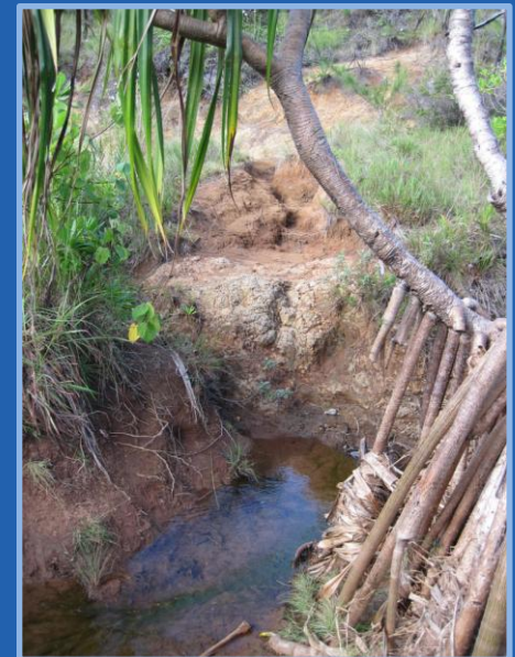
FIGURE 4 Existing Trail Segments