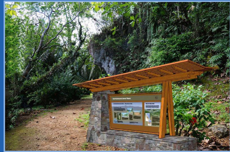
FIGURE 1 Existing Trailhead